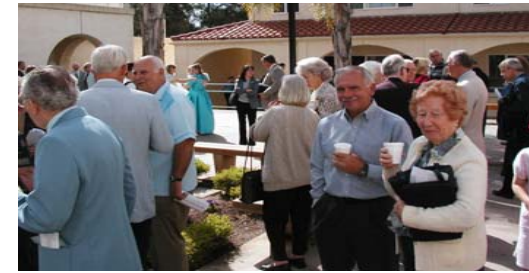
Sunday Morning Fellowship after Worship

Prime Time Disciples Bible Study Fellowship Grace West Coastal Families Families in a Fallen World Family Night Bible Study Fellowship