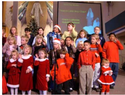
Children's Worship singing Special Music at Christmas time.

There are many opportunities for you to be a part of the amazing ministries happening here at Grace. Opportunities for spiritual growth, fellowship and service. Come and share your gifts so that the Body of Christ can be complete!