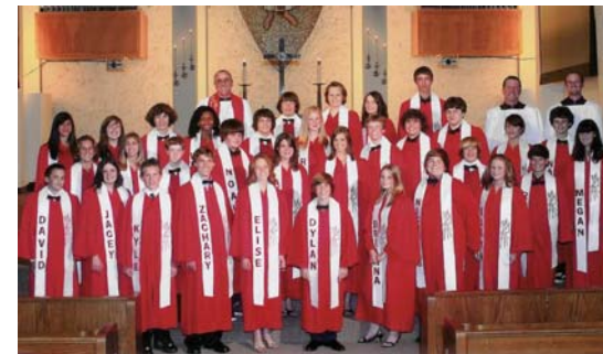
2007 Eighth Grade Confirmation Class.